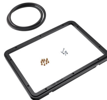
1400PF Special Application Panel Frame