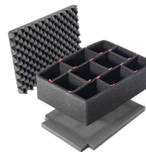
1400TPKIT TrekPak Case Divider Kit