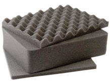
1401 3 pc. Replacement Foam Set