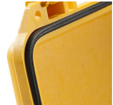
1753 Replacement O-ring