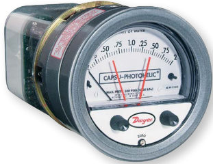
Series 43000 Capsu-Photohelic® switch/gage

Set points are instantly adjusted with front knobs.