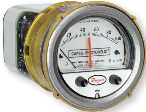
Series 43000 Capsu-Photohelic® switch/gage with brass body